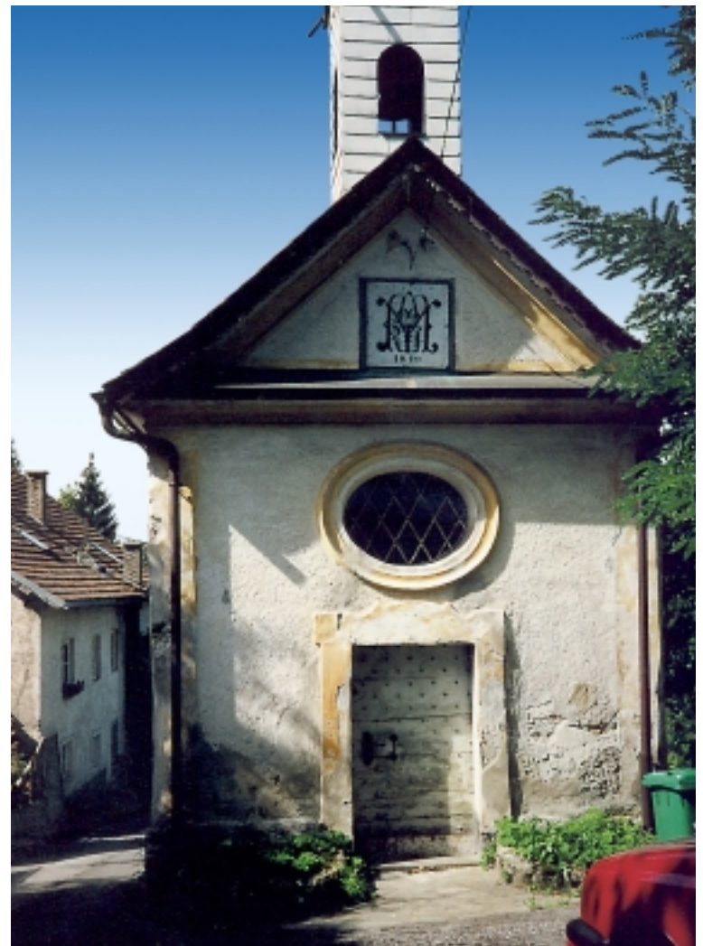
Successful reconstruction of a chapel in Gnigl, a municipal district of Salzburg (A): With damp wall plaster also damp brick-work can be reconstructed in such a way that this is protected durably against further negative influences of humidity.

The Peter Greven Fett-Chemie has adapted the properties, with respect to application technology, of soaps and metallic soaps to the requirements of the construction industry. The result is a wide range of special products with a broad range of application, which in this information are represented in the form of a summary. On request we can provide you detailed information on the individual products. If not noted down otherwise, the indicated dosing quantities refer to the dry substance. They, however, represent approximate values, which may be different from the values in practice, e.g. owing to high proportions of binding agents or larger quantities of lightweight aggregates in the mixtures.